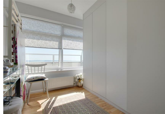
Bedroom one 12'5" x 8'0" (3.8 x 2.46)